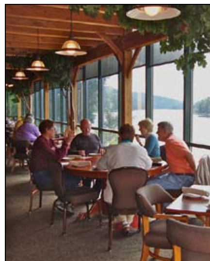
Our Segway group inside the Allegheny Grill