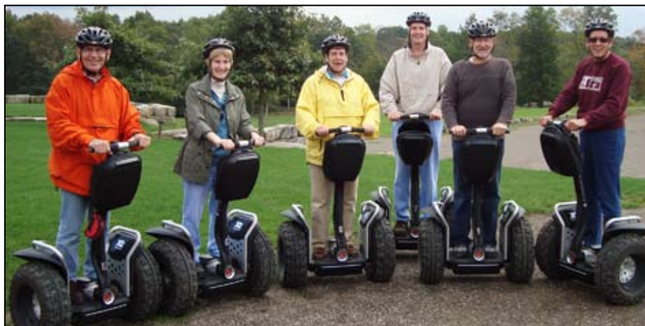
Our Segway tour group this past September