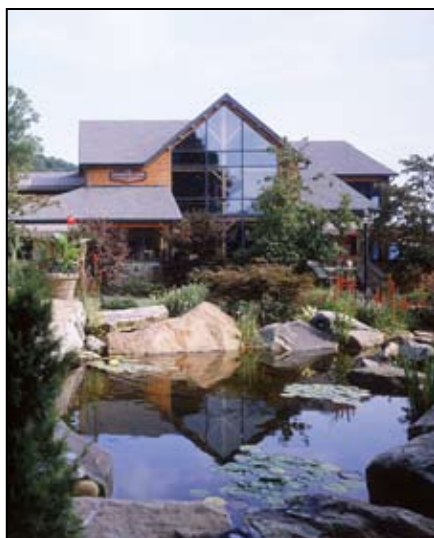
The Allegheny Grill