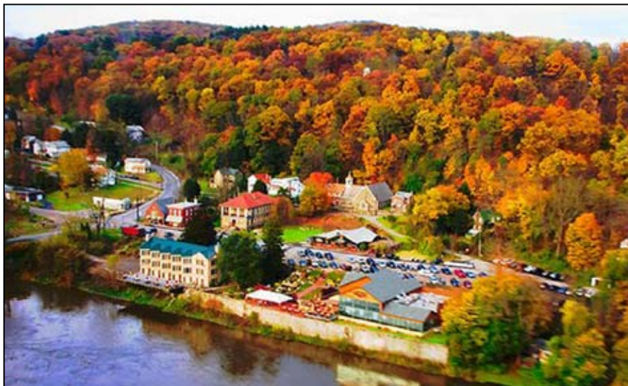
Foxburg from the air