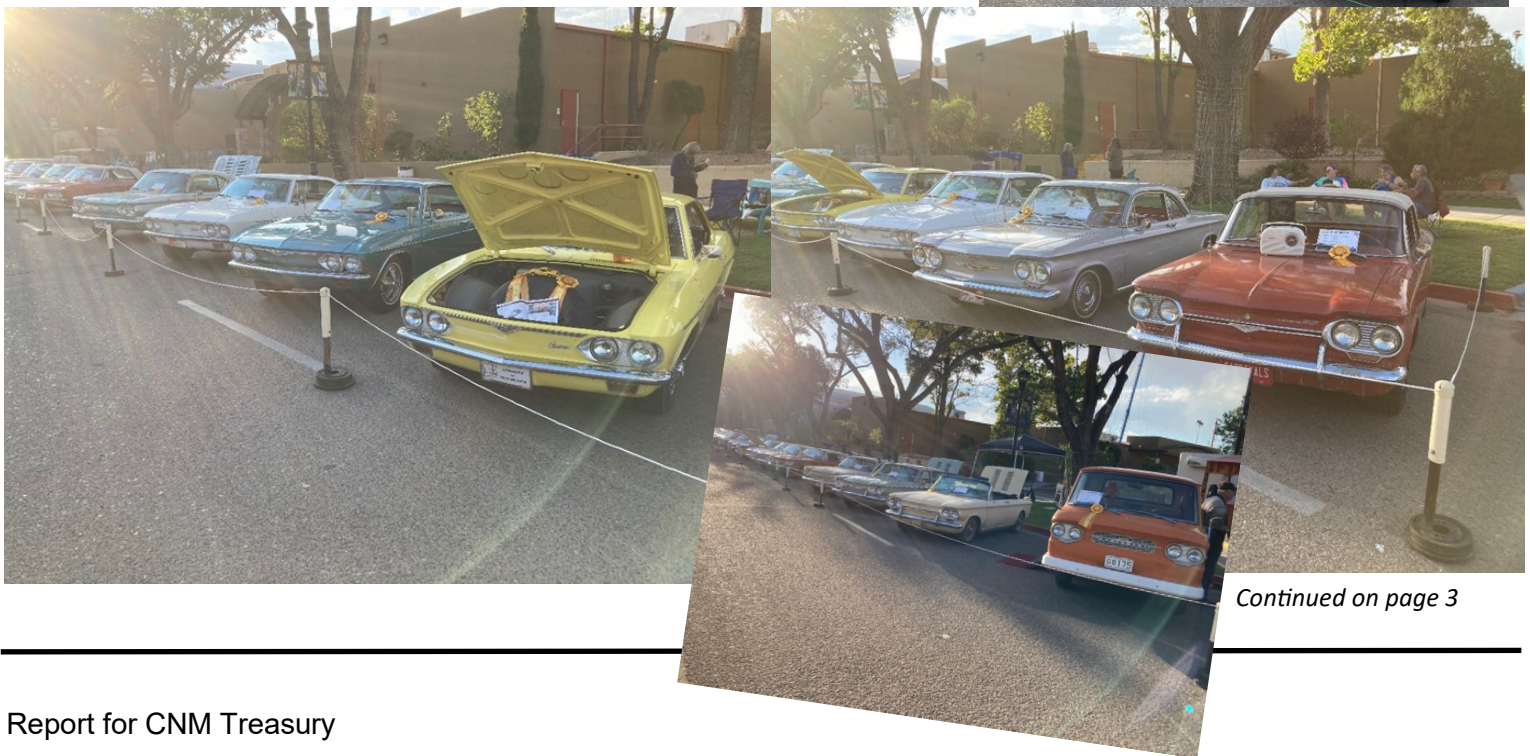
Continued on page 3