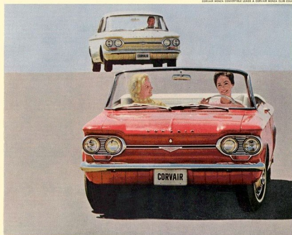
1964 CORVAIR by CHEVROLET