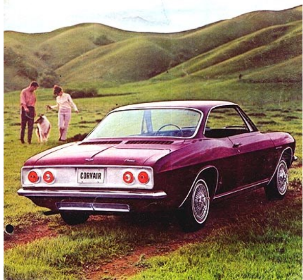
On the Cover: Photo from the CORSA Convention from Dave Huntoon