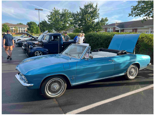
Or maybe a blue convertible with white interior?