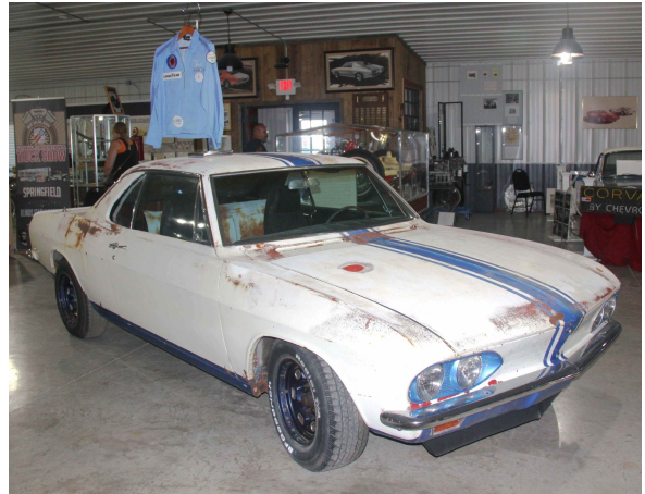
The Yenko Stinger a "tag" car