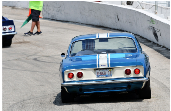
Staging before the start line.

after the first 2 runs in the autocross. However, I did manage to cut another 1.5 seconds on my 3rd pass but I thought I had some turn cut-out that hurt my time. I found out on my 4th run that my gas gauge which was showing 1/2 tank was actually empty as I coasted through the finish line about 10 seconds slower than my 3rd run. An easy fix as I had my gas can in the pre-grid and had put some in to get weight balance but didn't realize I was running on fumes before it was too late to add more. Oh well, still won my class by more than 5 seconds so not much to complain about other than not posting a lower time to compare to the faster classes.