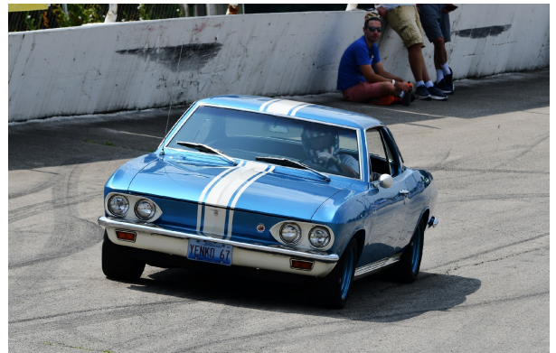
Rob on course sporting blue painted solid steel wheels with some sticky tires - autocross mode.

The Yenko was running really, really well and I had almost a 10 second advantage over others in the IS-5 class