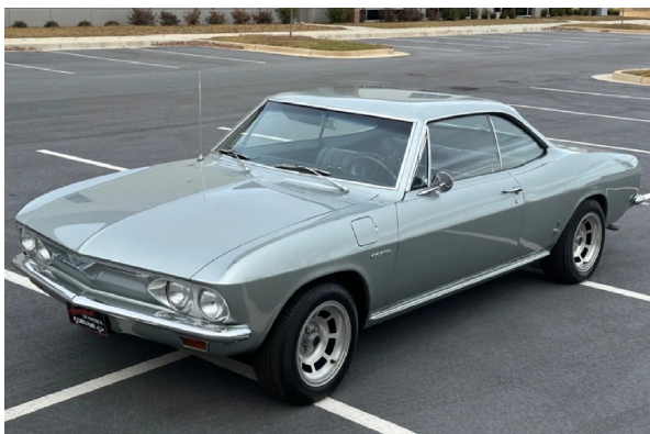
1966 Corsa Coupe, 4speed. Sold fo $10,750 Nice car, buyer got a good deal

Glen Rittenhouse follows sales on Bring-a-trailer. Last month he spotted two Corvairs listed on the site.