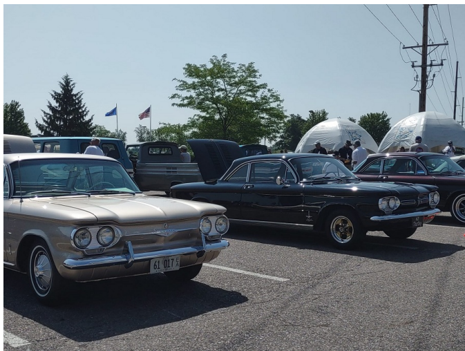
On the left, the 61 coupe sits on the CORSA Convention concours show field.