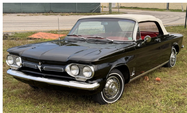
1962 Monza Spyder Convertible. The condition was only fair but it is a first edition spyder convert. Sold for $10,900