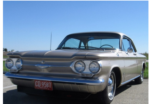
The 61 coupe at a 2016 PCCA meeting