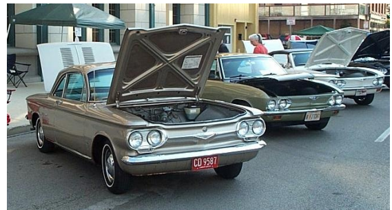
Prepped for judging at the 2005 SOS Show