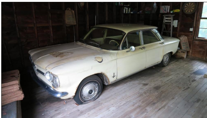
Ralph Nader's 1962 Corvair... no kidding!

Anybody interested in buying a 1962 Corvair? You won't believe who the seller is. When I went back to the Cobo Center in downtown Detroit to collect my 1960 Corvair that was lent to the Automotive Hall of Fame for their event, Ralph Nader was there. And I did get a chance to chat with him. He amazed me by identifying my car as a Canadian build! How about that? He also mentioned that he has a rough '62 Corvair back in Connecticut that he wanted to sell. Now who would want to buy a Corvair formerly owned by Ralph Nader (or at least owned by the organization that runs his Tort Museum in his hometown of Winsted)? I gave Ralph my contact info and he promised to have his guy at the museum contact me.