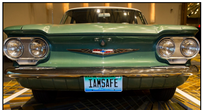
This license plate was in place for the AHoF Induction Ceremony