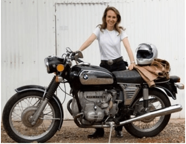
Congresswoman Gabrielle Giffords and a vintage BMW motorcycle