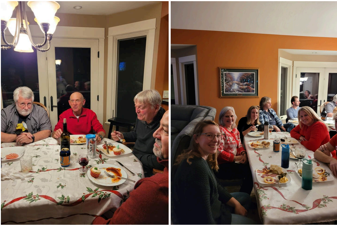
A couple of pictures from the 2022 Christmas Party.