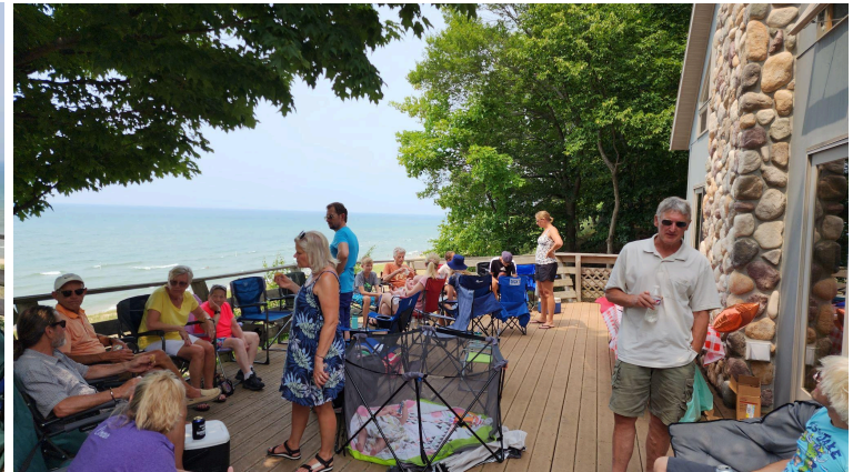
Left - 2021 summer picnic, Right - 2023 summer picnic