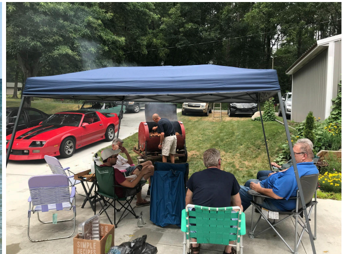
Left - swimming in Lake Michigan at the 2017 summer picnic, Right - 2018 summer picnic