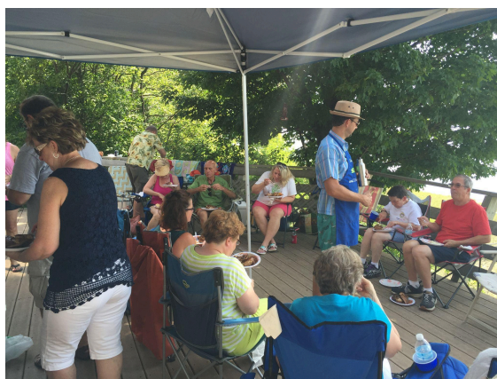
Left - Corvairs crossing the covered bridge at Fallasburg Park in 2014, Right - 2016 summer picnic