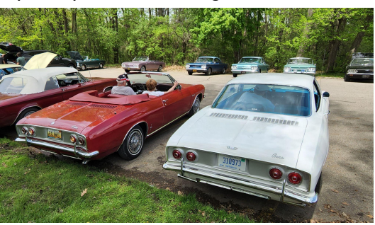
Left - at Fallasburg Park in 2020; Right - at Frances Park in Lansing in 2022