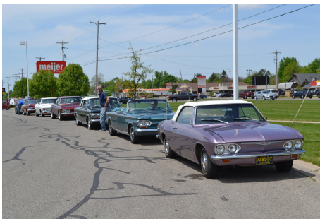
Left - at Dog N Suds in 2013; Right - pit stop in Grand Ledge in 2016