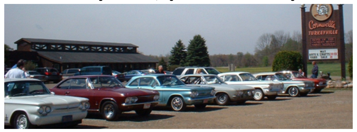
At Turkeyville in 2005