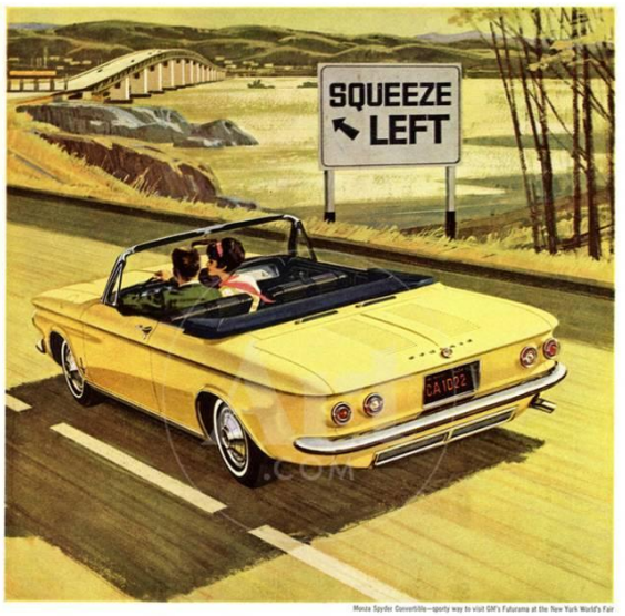
Because of the way it hugs and squeezes

... you'll fall in love with a beautiful buy. Drive a Corvair on a stop-and-ge abopping trip or jasst I the country. Table It in any kind of traffic, on any kind of the country. Table It in any kind of the country. Table I was a state of the control of the country try special kind of car. Right away Corvair's trin size and shape givey out feeling, may be for the first time in your life, that you're the feeling, may be for the first time in your life, that you're the