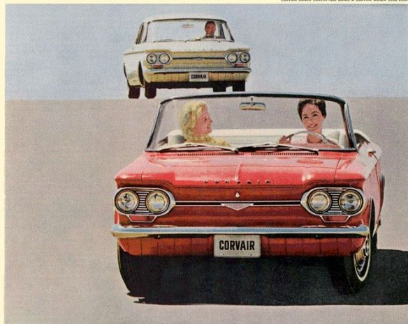
1964 CORVAIR by CHEVROLET