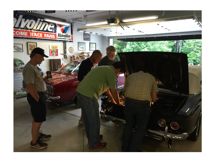
See July Events Recap on page 3

The WMCC board meeting will be on August 25 at 6:30 PM at Woody's.