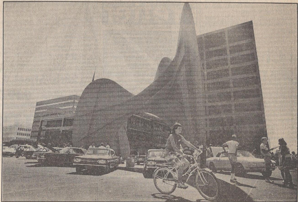
Old Corvairs attract a crowd on the Calder Plaza.

About 1.7 million of the sporty vehicles were manufactured through the 1960s. In 1965, consumer advocate Ralph Nader based his book, "Unsafe at Any Speed" on the Corvair. Nader said the car had a "peculiar friskiness" and rear-wheel bearing problems that