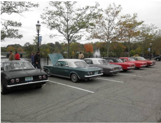
Notice the convertibles have the tops up. Brrrr.