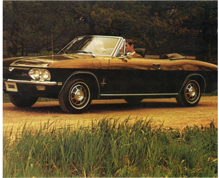
Front Cover: Monza Sport Coupe above: Monza Convertible