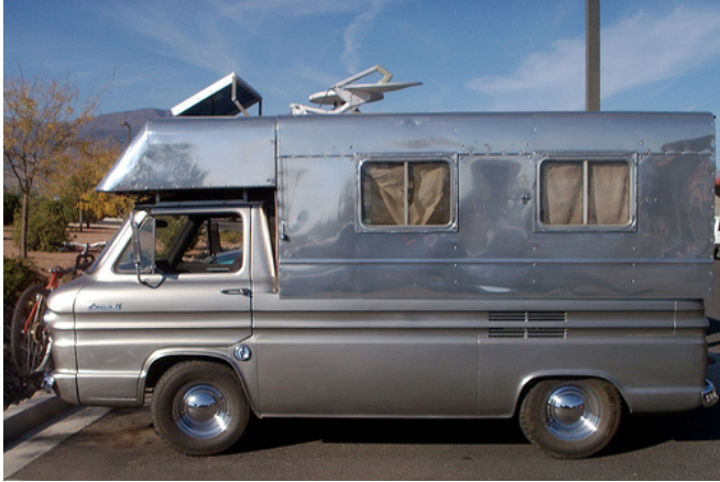
Some random Ramside pictures from the internet.