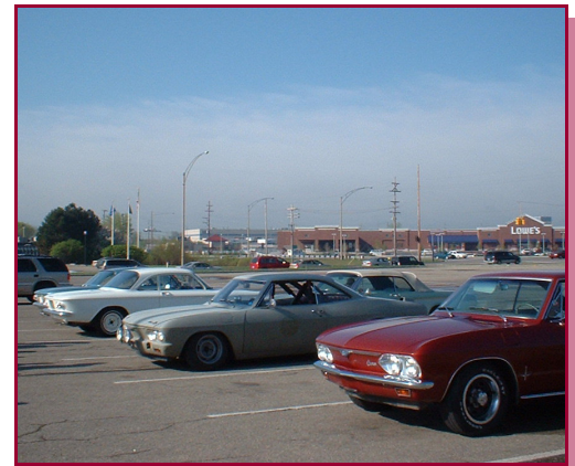
Corvairs lining up for our Spring Dust Off