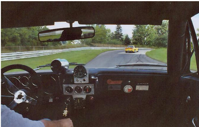
The view from Dan Konkle's racer on the track at Waterford

Dan Konkle took his racer to Waterford Raceway last