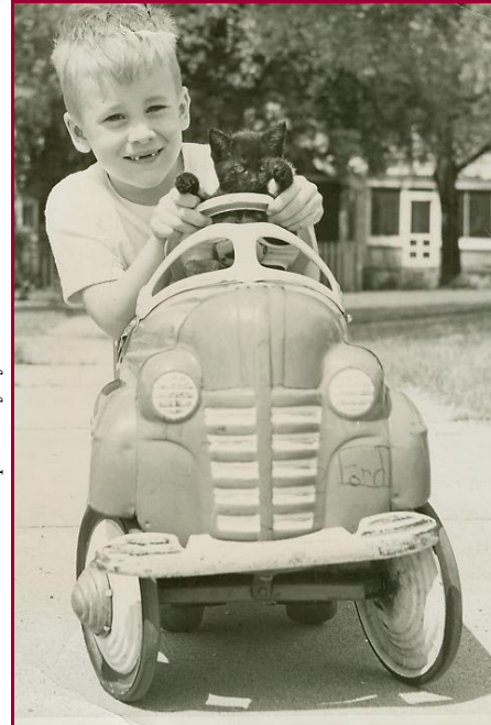
Who is this?

Please send in photos and biographies so you can be included in this feature.