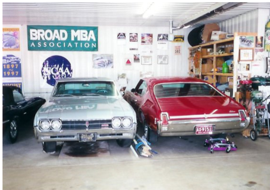
A 1966 Olds 442 and a 1969 Olds Cutlass.