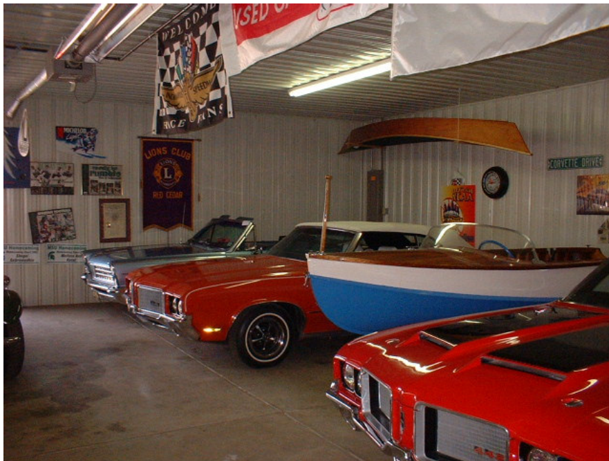
From one of the barns.