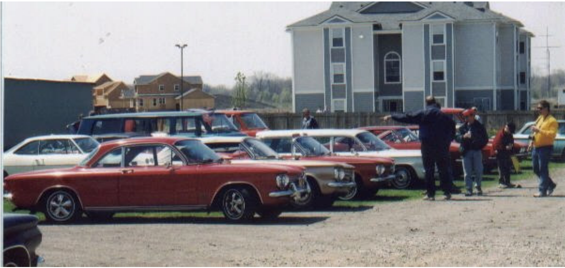
Corvairs on display.