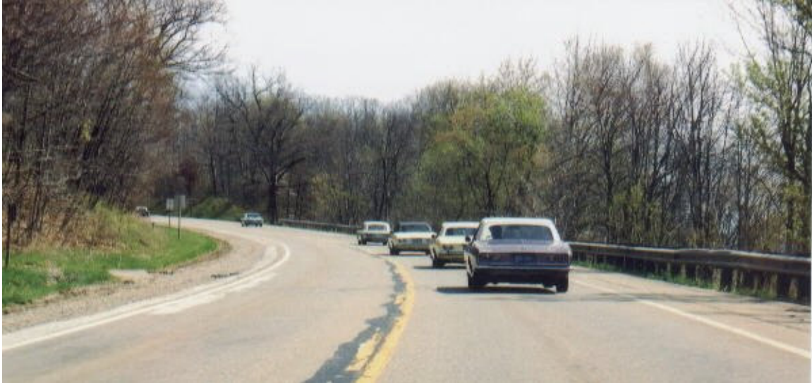
On the road to Lansing.