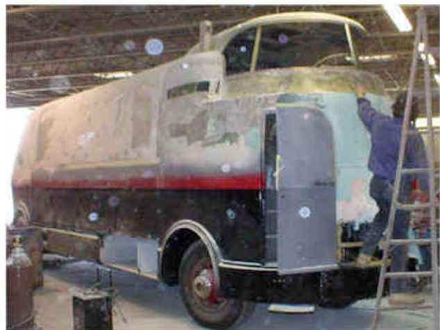
Left: How the Futurliner looked in 1999. Right: How the Futurliner looked on 3/25/03.

There has been some discussion among the board members about setting up a tour of the Futurliner or even volunteering in some way. This can be discussed at the April meeting. For more information and photos, visit the Futurliner web site at http://www.futurliner.com . The photos and some of the text for this article were taken from this web site.