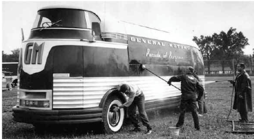
An original photo of a Futurliner.